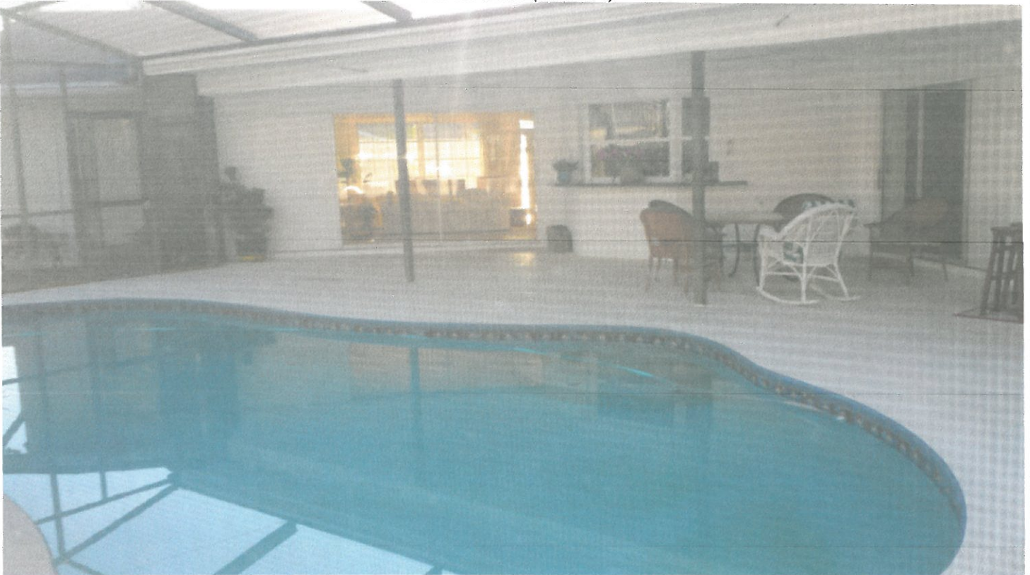
Rear of House (12/11/14)

If submitting more photographs than will fit on the preceding page, affix the additional photographs below. Identify all photographs with: date taken; "Front View" and "Rear View"; and, if required, "Right Side View" and "Left Side View." When applicable, photographs must show the foundation with representative examples of the flood openings or vents, as indicated in Section A8.