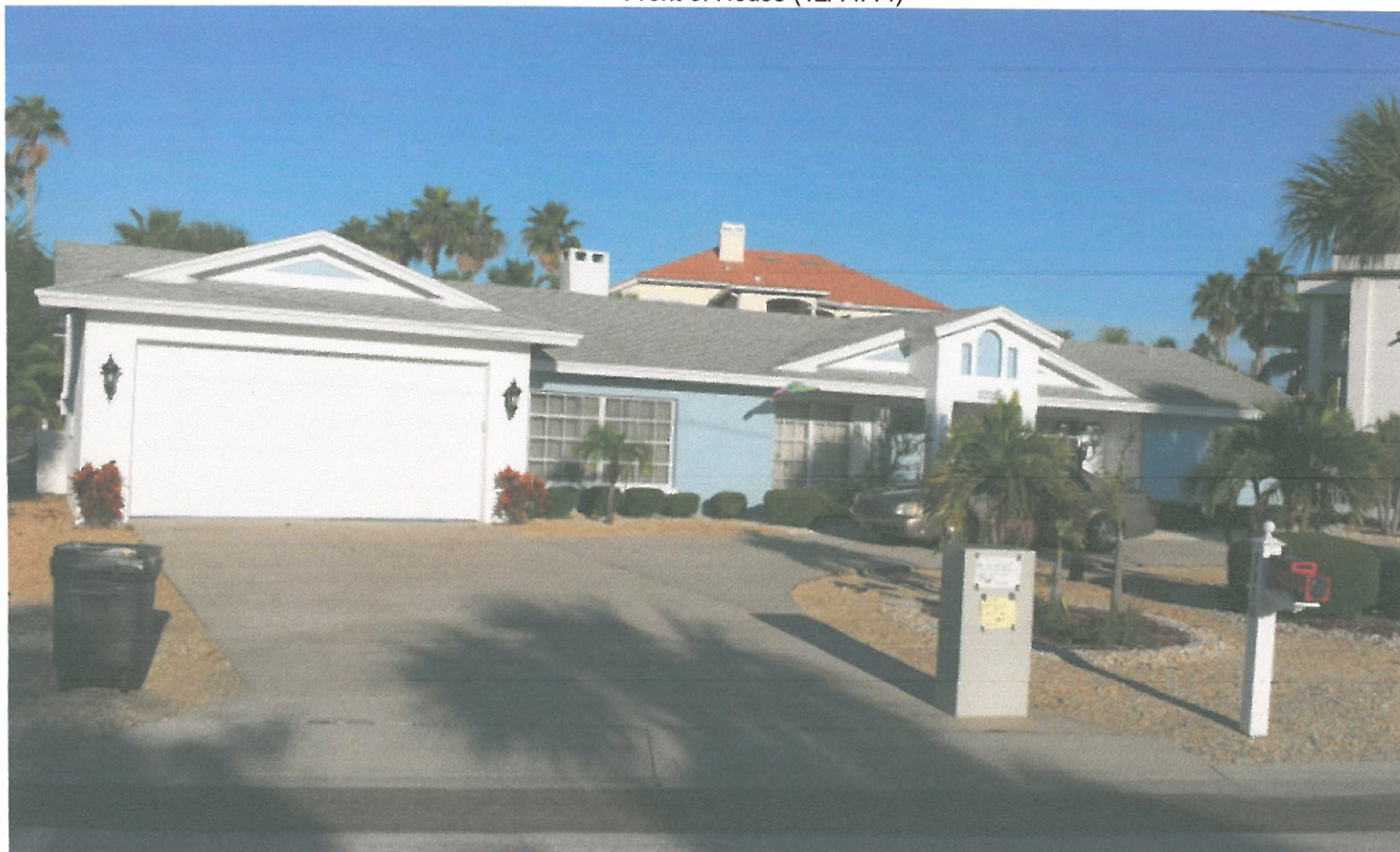
Front of House (12/11/14)

If using the Elevation Certificate to obtain NFIP flood insurance, affix at least 2 building photographs below according to the instructions for Item A6. Identify all photographs with date taken; "Front View" and "Rear View"; and, if required, "Right Side View" and "Left Side View." When applicable, photographs must show the foundation with representative examples of the flood openings or vents, as indicated in Section A8. If submitting more photographs than will fit on this page, use the Continuation Page.